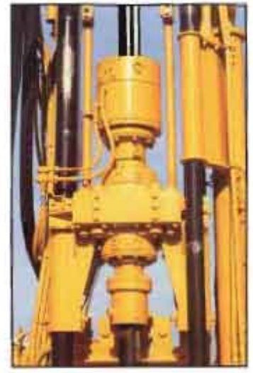
Fluted kelly and chuck assembly