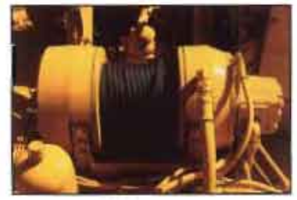
8500 lb. hoist