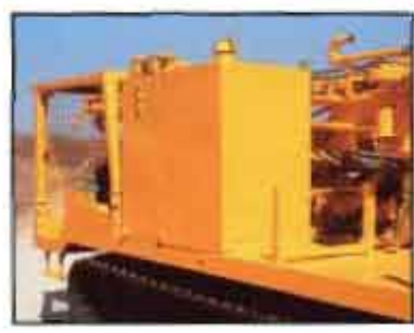
140 gallon water tank