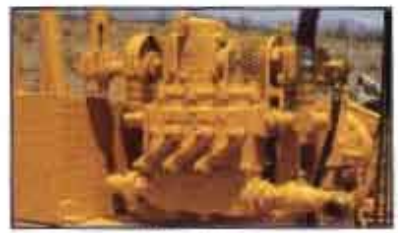
FMC Triplex 40 gpm/800 psi water pump